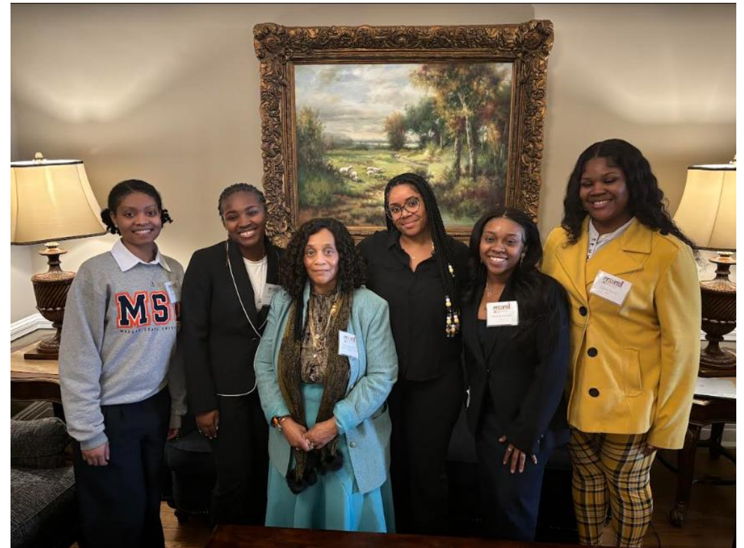
Students attending Advocacy Summit for the Maryland Academy of Nutrition and Dietetics in Annapolis, February 7, 2024