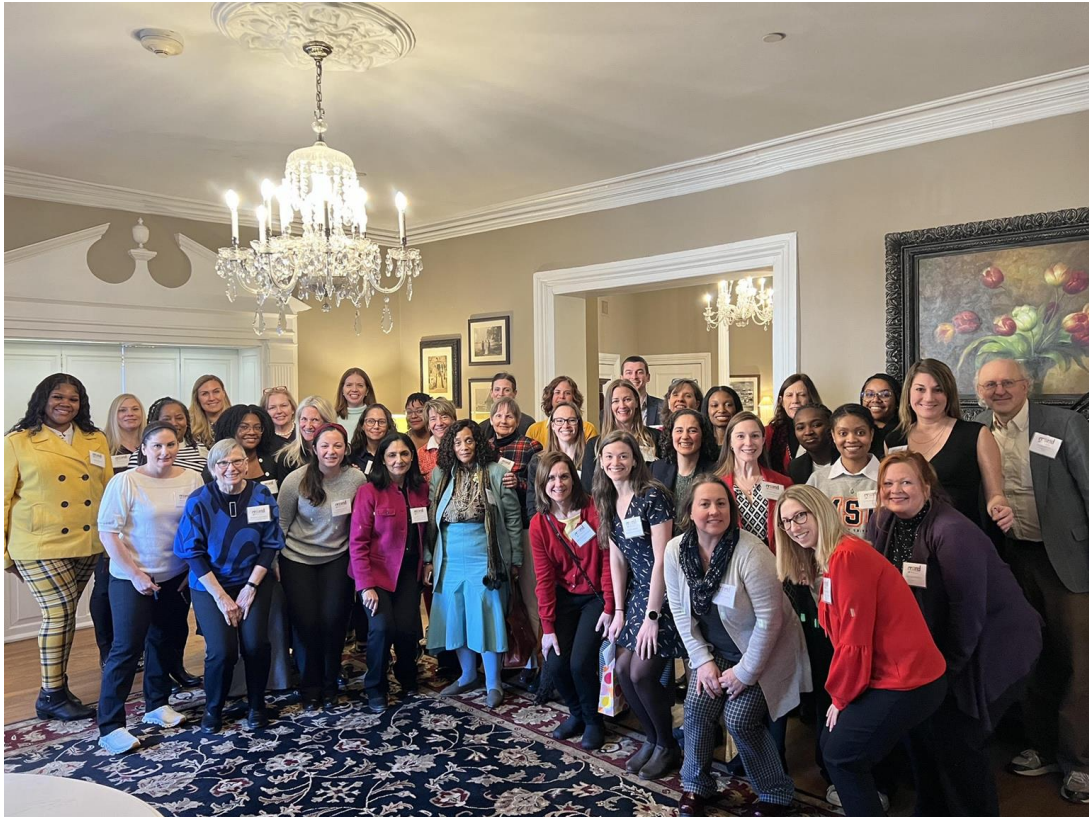
Maryland Academy of Nutrition and Dietetics group picture